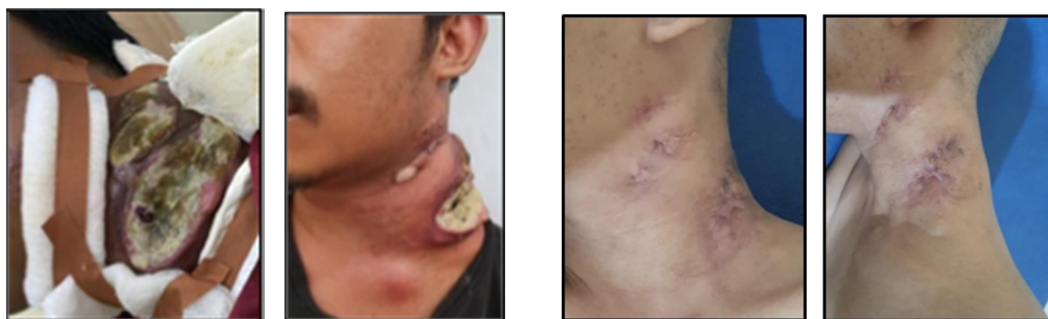
Figure 1. An open wound and a bulge on the left side of the neck before and after treatment.