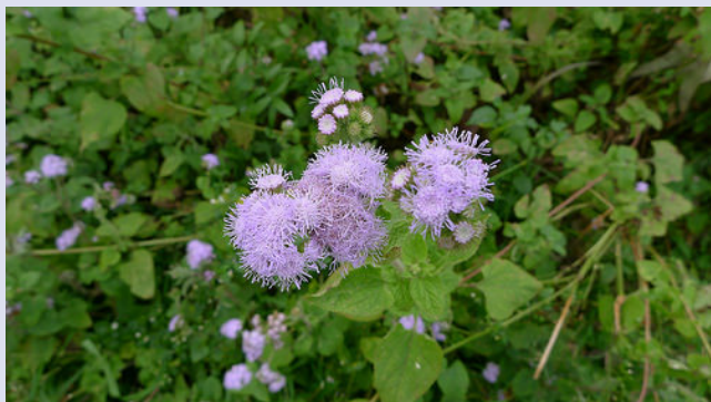
Figure 1: Ageratum conyzoides L.