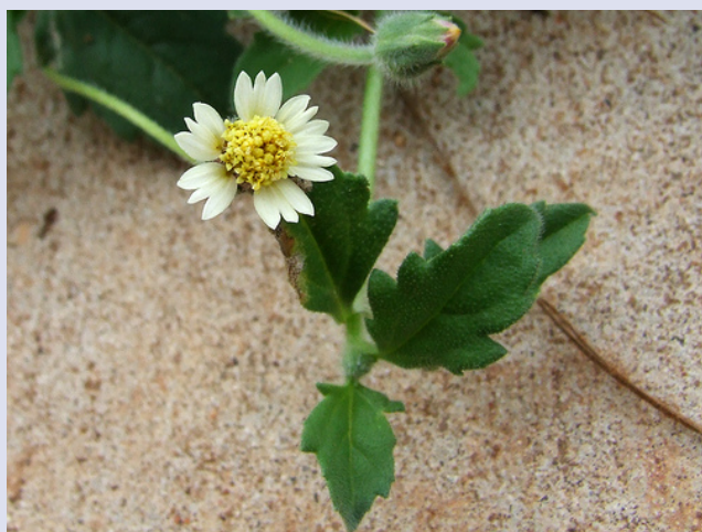
Figure 2: Tridax procumbens L.

The tridax plant is present all over India and is utilized as an indigenous medicine for a variety of ailments. 71 It has been widely used in the