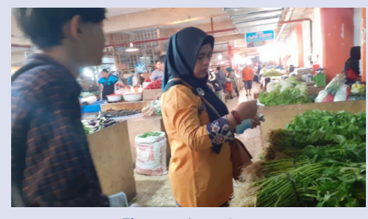
Figure 1: Interview.