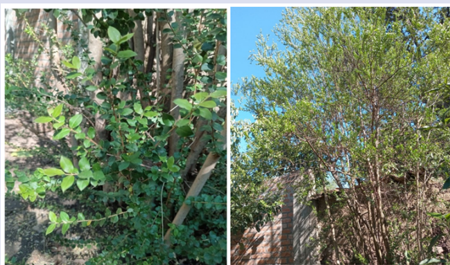
Figure 1: L. chequen plant located at La mar, Ayacucho, Peru.