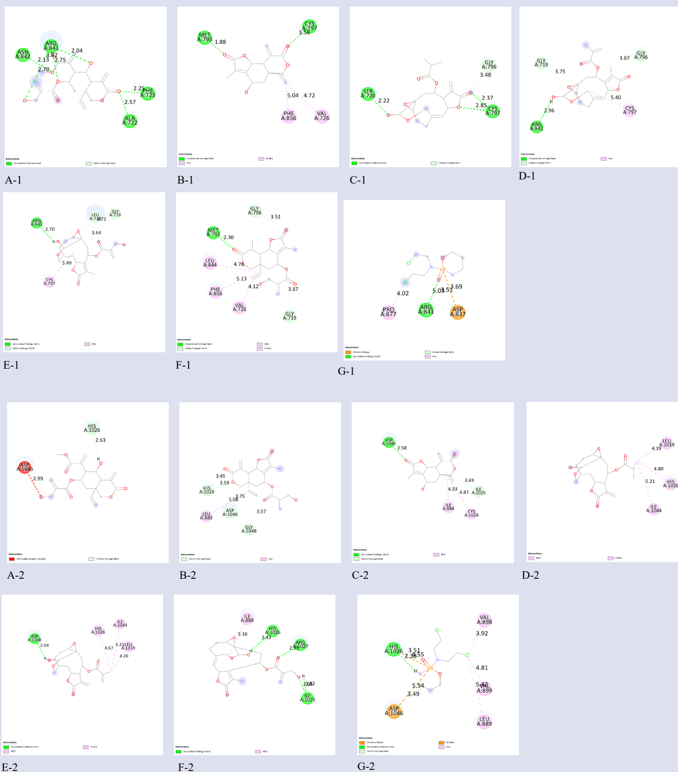
Figure 1: The distance and interaction of amino acid residue with test compounds and standard compound against EGFR and VEGFR. *A: vernodalol; B: vernodalin; C: vernolepin; D: vernomygdin; E: vernolide; F: hydroxyvernolide; G: cyclophosphamide; 1: EGFR; 2: VEGFR.