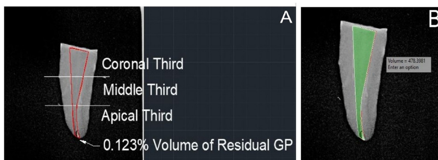
Figure 2: (A) and (B) Sample AutoCAD images for calculating the volume of residual GP.