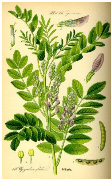
Figure 2. Glycyrrhiza glabra L (Sharma and agrawal, 2013; Zadeh et al. , 2013)

Glycyrrhiza glabra L. (Fabaceae) is one of the plants that can be used as medicine (IT IS, 2022). Glycyrrhiza is derived from the Greek words glykos, sweet, and rhiza, root. This plant is native to parts of Asia and the Mediterranean (Sharma and Agrawal, 2013; Sharma et al. , 2018). Ancient Egypt, Rome, East China, Greece, and the West all used the herbal remedy licorice, since the 16th century has been cultivated in Europe. Different species types of liquorice are grown in Europe, the United States, the Middle East, Southwest Asia, Central Africa, Afghanistan, and northern India (Wahab et al. , 2021).