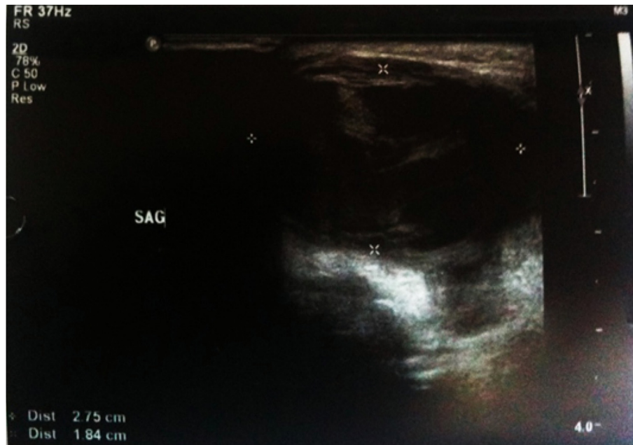
Figure 1: Doppler USG view of the mass.

Aneurysms associated with STA are only less than 1% of all arterial aneurysms reported up to date. 3 Almost all of the reports were about pseudoaneurysms. Superficial location over the temporal bone and muscular tissue weakness around provides loose support to STA, making it vulnerable against minor and major traumas like high-velocity particles, including gunshot or other war-related wounds, blunt traumas, vehicle accidents, and sports