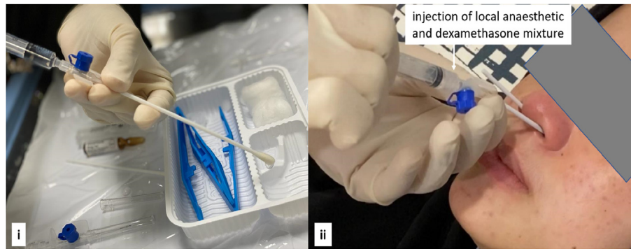
Figure 2: SPG block technique for patient B. i: Attachment of 22G plastic branula to the cotton-tipped applicator. ii: Infusion of LA with a 22G plastic catheter branula attached to a cotton-tipped applicator.

recurrent headache associated with neck pain and stiffness and requested a second SPG block. The findings of a complete neurological examination were unremarkable. The second SPG block was performed on the following day with a longer-acting LA, ropivacaine 0.75% mixture with dexamethasone 8 mg. The headache improved from severe to mild immediately after the procedure, but the relief lasted for only 1 h. Unsustained relief of her headache warranted an EBP. The EBP performed on the same day was uneventful, and she had complete resolution of PDPH 1 h later.