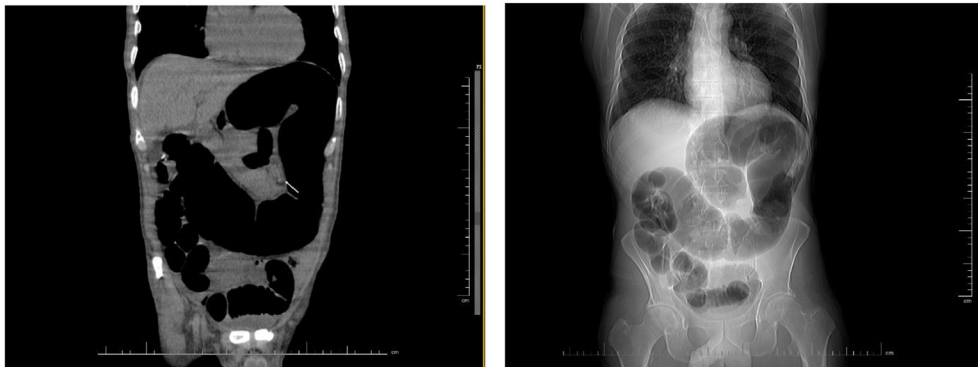
Figure 1: Appearance of CT scan.

One of the significant risk factors of colonic volvulus is aging, which is strongly associated with chronic constipation.