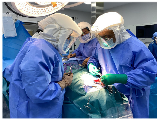
Figure 3: Intraoperative precautions and utilization of the personal protective equipment (PPE).