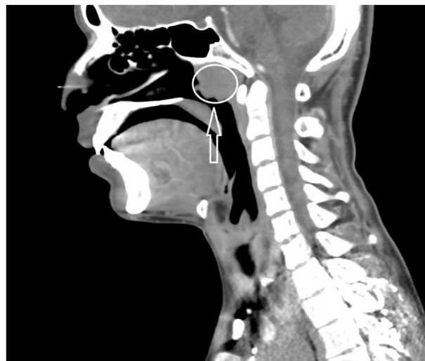
Figure 2: Neck CT.

axillary or inguinal palpable lymph nodes (LN). His chest exam was normal aside from dilated veins on his chest; the cardiac and abdominal exams were also normal. His brain CT showed a lobulated left nasopharyngeal mass lesion extending into the left nasal cavity, measuring 4.3 \times 3.5 cm (Figure 1). His neck CT showed an enlarged cervical LN at left level II, measuring 3.9 \times 3.1 \times 5.7 cm (AP \times ML \times CC) and an enlarged, partially calcified right retropharyngeal LN, measuring 2.4 \times 2.3 cm (Figure 2).