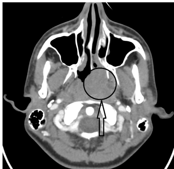
Figure 1: Brain CT.

A 16-year-old Middle Eastern adolescent with a two-month history of left upper neck swelling noticed incidentally that it was increasing with time, however, there was no association with fever, weight loss, or night sweats. There were no local symptoms such as pain, tenderness, redness, or pus discharge. Previously, he had a history of five days of fever and sore throat that resolved spontaneously. He denies any other swelling in his body. The patient tested positive for COVID-19 and symptoms started on the second day after admission. He is neither sexually active, an IV drug user, nor an alcohol drinker, and there is no radiation exposure. His vaccinations are up to date, and his father died from an unknown malignancy. On examination, he had a single lateral cervical swelling, firm and fixed, non-tender 4 \times 4 cm, no fluctuation, and non-sinuses. He had bilateral posterior auricular swelling ( 2 \times 1 , 2 \times 3 ), no supraclavicular, or