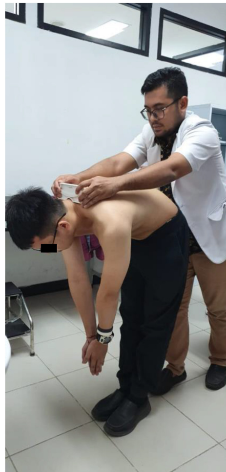
Figure 2: Measurement of ATR with Bunnell scoliometer ( \pm 0.1^\circ ) in standing position with forward bending.

The participants were called back to have back postural assessments using scoliometer plastic economy (Baseline®) by an orthopaedic specialist at the Department of Orthopaedic and Traumatology, Universitas Sumatera Utara Hospital during March 2020. Scoliosis screening with Adam’s Forward Bending Test in the given position was as follows: body parallel to the floor, palms closed and arms straightened down to form an angle perpendicular to the body, then the scoliometer is moved along the patient’s spine (Figure 2). 11 In general, the scoliometer measures the angle of trunk rotation (ATR) with a cut-off criteria of