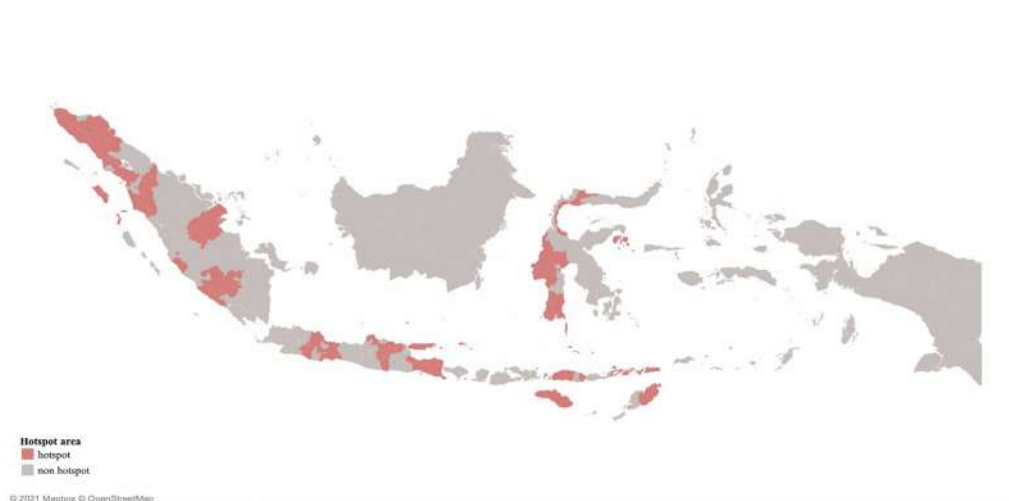
Figure 2. Stunting Hotspots in Indonesia (2018)