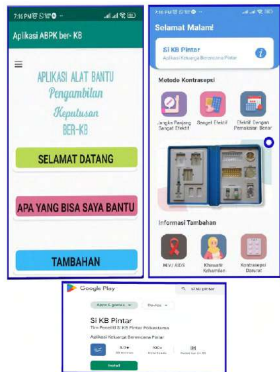
Figure 2. Main Menu in Decision-making Tools for Family Planning Application and Si KB Pintar

veloped, and the confounding variables were evaluated by comparing the OR of the primary variable (family planning counseling) before and after a confounding variable was excluded. Then, the variable with the most significant p-value was excluded. Because the difference in the OR of the family planning counseling variable was higher than 10%, age and parity were included in the model. Table 3 shows that participants given family planning counseling using an application had a 2.4 times higher likelihood of using postpartum contraception compared to flipcharts after controlling for age and parity variables.