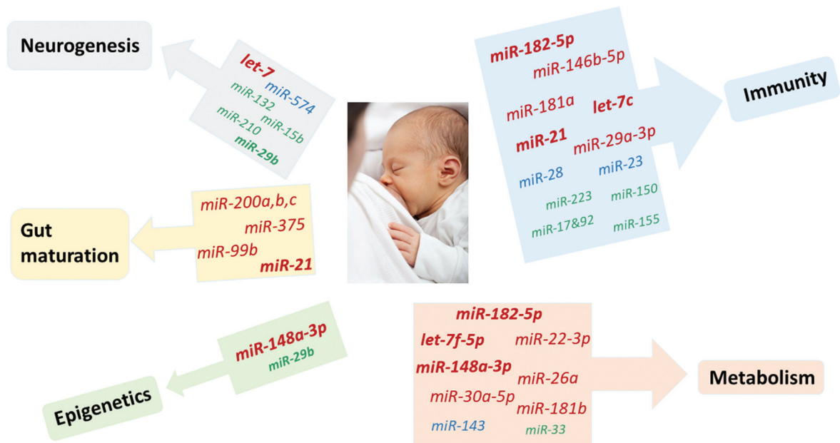
FIGURE 1 Potential effects of human milk exosomal microRNAs (miRNAs) on infant development. The font size and color of each miRNA corresponds to the abundance classification. The classification was based on the total count reads reported by Liao et al. (48) with A > 250.00 , 250.00 \geq B > 150.00 , 150.00 \geq C > 50.00 , and 50.00 \geq D > 0 sum of the total normalized read counts (Supplemental Table 1). miRNAs playing a role in \geq 2 functions are in bold. miR, microRNA.