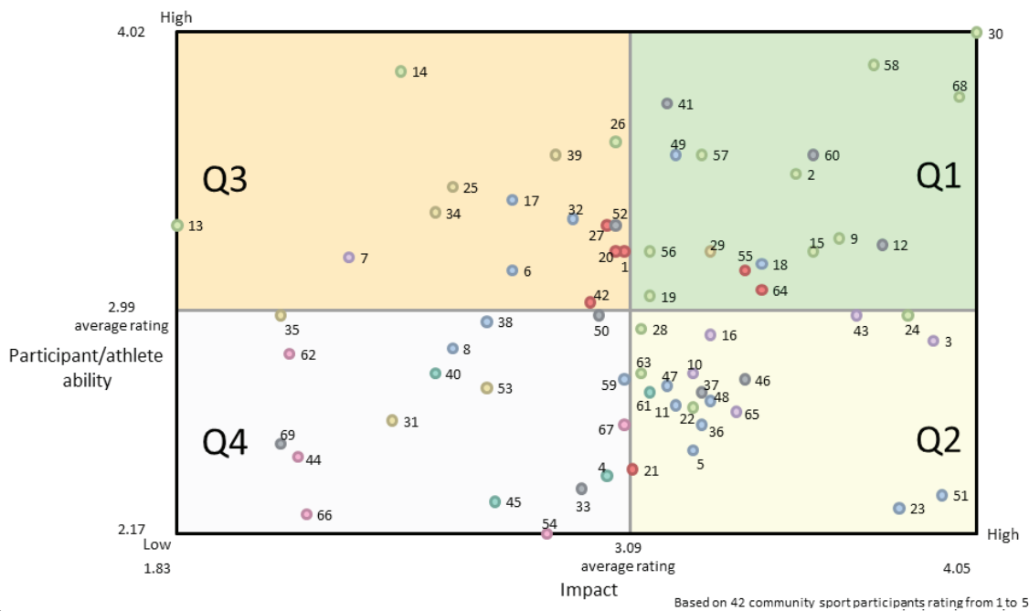
Figure 1: Go-zone graph plotting the mean rating of each challenge for impact on return to sport and player/athlete ability/capacity to overcome the challenge.