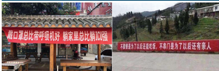
Figure 2: Slogans of fighting against epidemic.

President Xi stressed: "we should encourage the use of big data, artificial intelligence, cloud computing and other technologies to play a supporting role in epidemic detection, virus traceability, prevention and control, resource allocation and other aspects." 29 The government and various ministries and commissions used ABCD+5G technology when they made adaptable governance. First, they quickly built a digital control platform to identify confirmed cases and their close contacts and to monitor the body temperature of people flow. Second, these technologies were used in strengthening