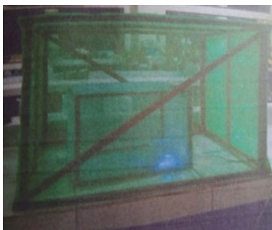
Image 2. Test Cage

The stages of making belimbing wuluh leaf powder are as follows the leaves are collected approximately 500 grams, washed with water, then cut into small pieces. Furthermore, they were dried at room temperature. After they dry, they are mashed using a blender so that they become powder. The cage for testing consisted of 2 kinds of boxes, the first box measuring W: 50 x W: 50 x H: 50 cm as a large cage and the second box measuring W: 25 x W: 25 x H: 25 cm as a small cage. For large cages and small cages, the surroundings are covered with mosquito netting. However, when doing the test, each side of the small box is covered with plastic. But in the middle of one side is made a circle that is not covered with plastic for the air ventilation so the meat flies can breathe. In some corners of the small cages, there were holes as the passages for flies to the large cage during testing.