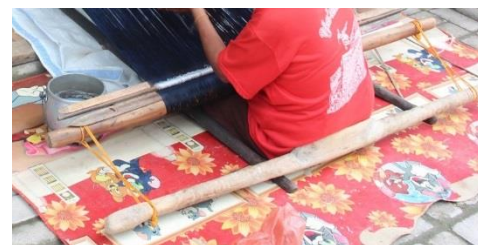
Fig. 9. tundalan (back of weaver) dan pagabe

Pagabe. Pagebe, a wood which functions as a thread holder and linking the 'tundalan'. See in figure 9.