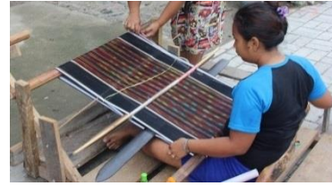
Fig. 15. Sitandakan

Sitandakan. In figure 15 is Sitandakan. It is the footstools when weaving, made of wood. The width of this foundation can be adjusted to the height or foot length of the weaver.