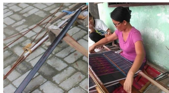
Fig. 10. Baliga dan how to uses 'baliga'

Baliga. Baliga, The Tool for tightening threads, which are pulled / shifted toward the weaver several times. See in figure 10.