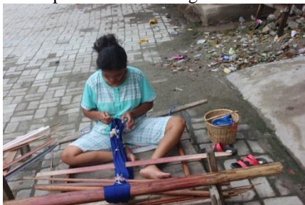
Fig. 5. mangani process

Mangani. Mangani is the process of thread stranding in the anian tool, which is the wooden beam above which is attached / placed by a short stick as an anian foundation. The yarn will be arranged according to the ulos size and based on the calculation of the number of sheets of yarn according to the design and color composition of Ulos to be produced. This is the initial process of weaving.