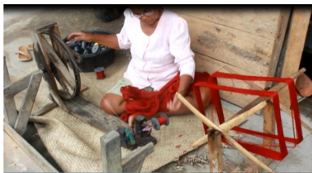
Fig. 4. Op. R br Simarmata, rolling the yarn with sorha

Pangkulhul atau makkulhul. In figure 4, a women is tidying up the yarn by rolling it using a tool called sorha. This process called makkulhul.