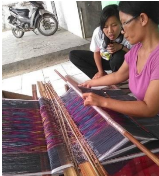
Fig. 12. Hatulungan raised by a weaver

Hatulungan. In figure 12 is Hatulungan. It is a wooden tools for separating threads, usually with the help of nylon threads that have been arranged neatly per sheet of yarn to be woven, loosening the thread so that the turak can enter.