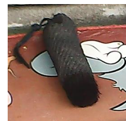
Fig. 2. palm Fiber 'Ijuk' (tool for mangunggas / pangunggasan)

Pangunggasan atau mangunggas. It is done by making rice porridge and can be added to celery or pandan leaves for applied to the thread. This process used palm fiber (ijuk) in figure 2. The goal is to make the thread strong, decompose neatly and shiny. It is carried out in two ways, namely 'menganji', dipping a roll of yarn in a solution of water and starch.