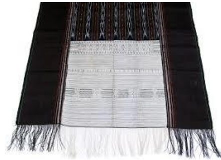
Fig. 20. Ulos Ragi Idup

This Ulos consists of five parts that are woven separately which are then neatly joined together to form one Ulos.