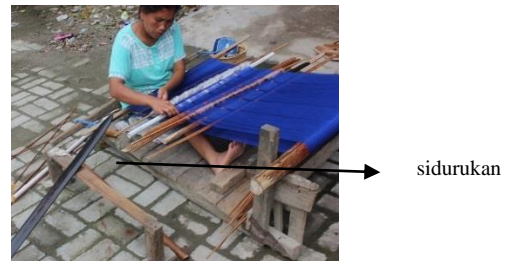
Fig. 16. Sidurukan

Sidurukan. The pole that is on the right of the weaver. Its function is as a base for looms such as pagabe, lidi, etc. See in figure 16.