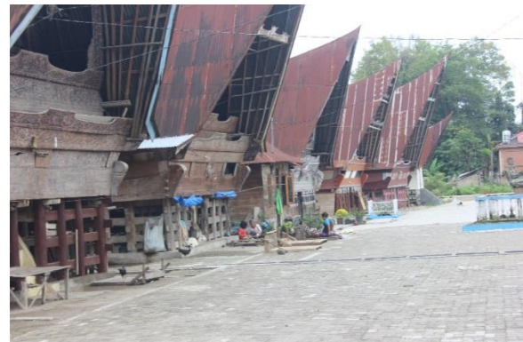
Fig. 1. Hutaraja, Lumban Suhi-Suhi Toruan Village, Panguruan district, Samosir Regency, North Sumatera

Hutaraja, Lumban Suhi-Suhi Toruan Village, Panguruan District, Samosir Regency, North Sumatra. It is a village that still preserves and maintains traditional weaving techniques (staining, mangunggas, mansorha, martonun,).