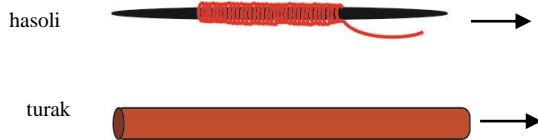
Fig. 11. Hasoli dan Turak

Turak it is the Tool for inserting threads through lungs thread cracks, it made of bamboo, as a container of hasoli.