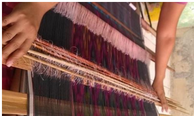
Fig. 13. Lidi

Stick 'Lidi '. Stick, in figure 13. It used for arrange the pattern or color motif of woven fabric. The total of sticks used is based on the ornament to be made. The more complicated the ornament will be as much as the sticks used.