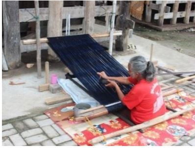
Fig. 3. mangungas process in Hutaraja, Lumban Suhi-Suhi Toruan village, Pangururuan district, Samosir Regency, North Sumatera

Pangkulhul atau makkulhul. In figure 4, a women is tidying up the yarn by rolling it using a tool called sorha. This process called makkulhul.