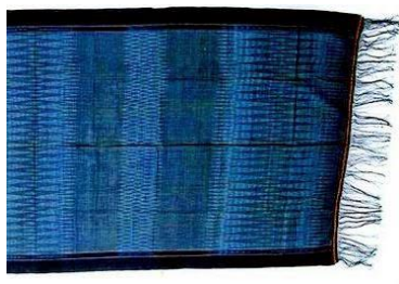
Fig. 18. Ulos Sibolang

b) Ulos Sibolang. Including the ulos used in the event of grief (death). That is, the ulos used by adults who have died, who do not have grandchildren, are called Ulos saput. In addition, it is also used by the wife or husband who is left to be called Ulos Tujung.