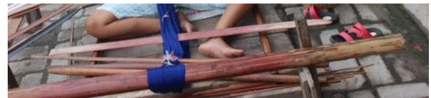
Fig. 8. Anian

Anian. In figure 8 is anian, it is a place / wood to string yarn before weaving.