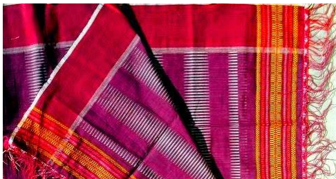
Fig. 19. Ulos Ragihotang

c) Ulos Ragihotang (Ulos Sirara). Ulos are most often used by the Batak tribe, this ulos usually becomes a bride gift that is holding a traditional Batak wedding ritual. Given by hula-hula (uncle of women) to the hela (son-in-law).