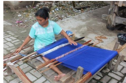
Fig. 7. weaving tools of Ulos Batak weaving

In the weaving work of ulos (martonun) there are several tools used, it will be explained below. It can see in figure 7.