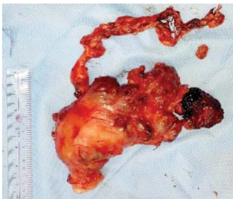
Figure 2. The specimen demonstrated perforation on the upper left side of the uterus

While waiting for chemotherapy, patient complaints of acute abdomen due to hemoperitoneum due to perforation of trophoblastic mass. Emergency laparotomy was performed, found hemoperitoneum and perforation on the upper left side of the uterus, total hysterectomy was performed.