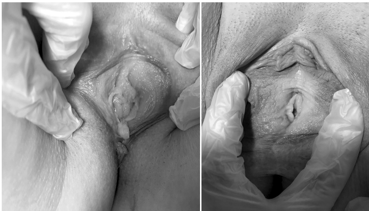
Figure 1. — Two examples of the patients who presented to this clinic and were diagnosed with VVP pathologically and clinically non-keratinized squamous epithelium (Figures 2 and 3).