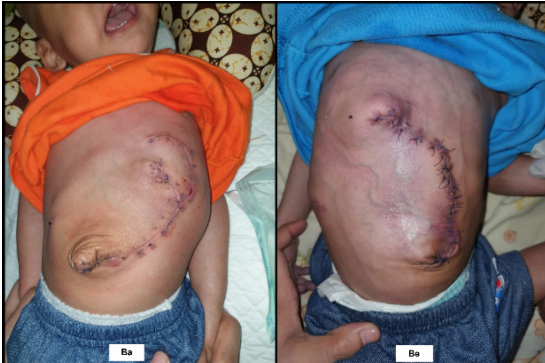
Figure 4. The twins on the seventh day of post-surgery.