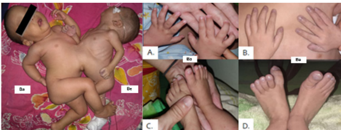
Figure 1. Omphalopagus or conjoined twins in September 2020. (A, C) Baby Ba's hands and feet. (B, D) Baby Be's hands and feet.

An incision was made in the marked skin, connective tissue, and muscles beneath (Figure 3). The fused portion of the liver was separated by harmonic scalpel instead of an electrosurgical instrument. The remaining fused parts were cut and resutured. The malrotated-intestines were corrected. We found unpredicted intraoperative findings included minor diaphragm defect and