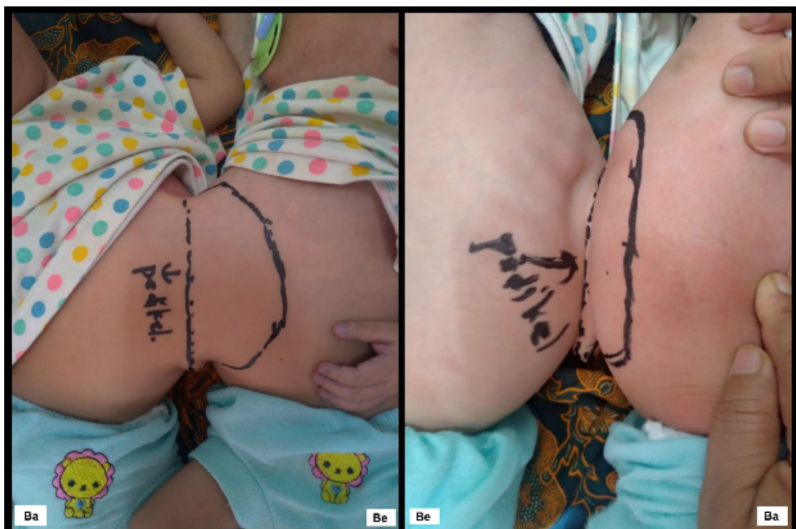
Figure 3. Surgical incision plan of omphalopagus separation. (Left) Anterior view. (Right) Posterior view.

underdeveloped ribs and sternum. Thus, the inferior portion of the sternum was connected to the cartilaginous rib with many ligations of secondary vascular connections. Finally, drainage and primary abdominal wall defect closure were performed using fascia and skin. The overall procedure took 10 hours to be accomplished. Be suffered oxygen desaturation, but returned to the normal range