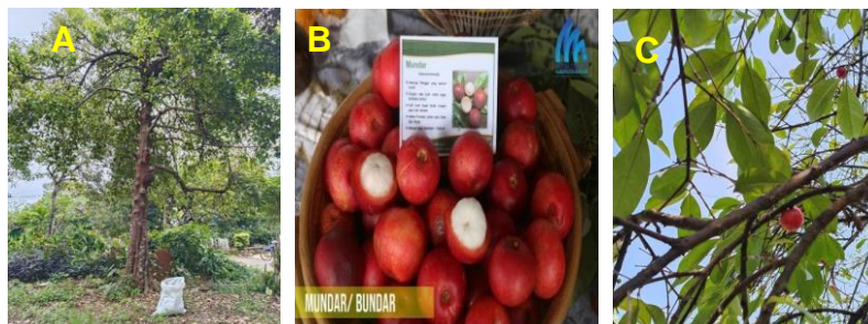
Figure 1. (A) G. forbesii King tree; (B) G. forbesii King branch; (C) G. forbesii King fruits

evaporated in a rotary evaporator, and thickened at 50°C in a water bath to produce a viscous extract with a consistent weight (Sutomo et al., 2020).